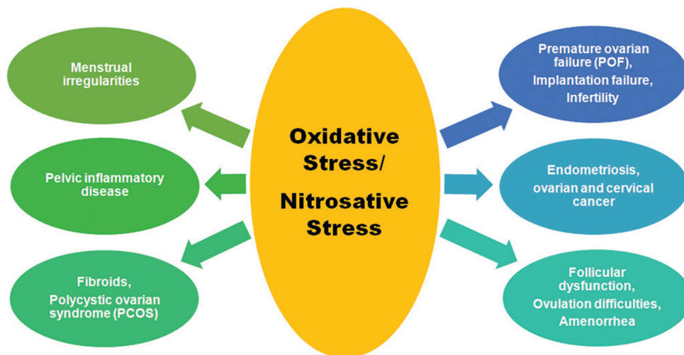
Figure 1: Different types of reproductive health problems due to reactive oxygen species/reactive nitrogen species.

Cofactors for copper, zinc-SOD (Cu, Zn-SOD, or SOD1), manganese SOD (Mn-SOD or SOD2), and selenium glutathione peroxidase (GPx) include copper, zinc, manganese, and selenium, respectively. [10] Table 1 shows the various natural dietary sources of these antioxidants.